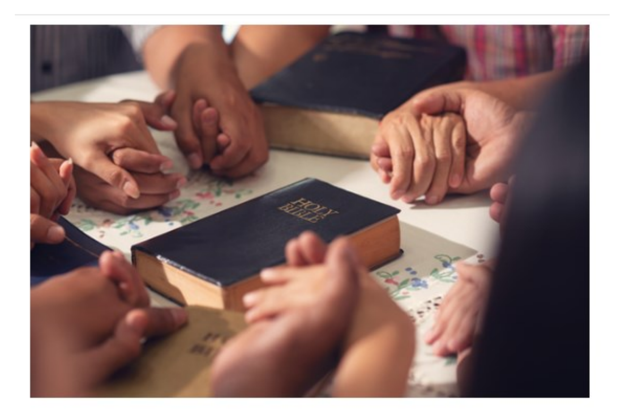
Jul 14, 2023 7:00 PM - Jul 16, 2023 Noon

2974 International Pkwy Lake Mary, FL 32746, USA (321)249-8036